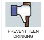
PREVENT TEEN DRINKING